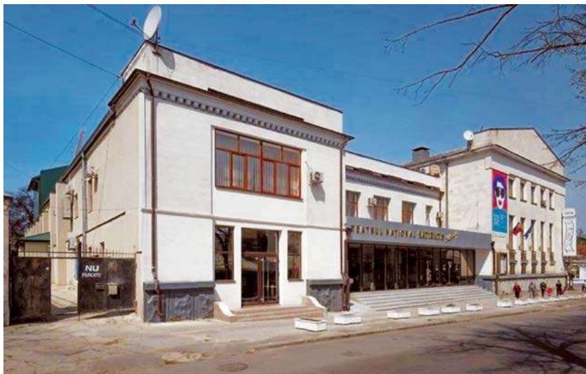
Fig. 8. The reconstructed building of the “Odeon” cinema, Chişinău (the author of reconstruction R. Spirer) (after BACU).

was to take into account a series of objections raised by architects and engineers, in particular the completion of the project documentation with the general plan, the improvement of the rear facade, the creation of sections through the stairs and the plan of the basement rooms showing the ceilings, etc. It was mentioned that the following problems remained unresolved: soundproofing of the service offices, visibility in the performance hall, arrangement of side accesses to the building, widening of the openings in the ground floor vestibule, replanning of the fire service rooms, changing the material of the partition wall above the stage portal, etc. The exterior decoration of the building was to be improved and a terrace was to be arranged in place of the exhibition hall under the dome. Finally, it was decided that the proposed project would be presented for approval to the Soviet of People’s Commissars of the MSSR [17]. According to the sketches of the architect Rozalia Spirer, the “Odeon” cinema was restored (1947–1948) [18], renamed in the Soviet period into the “Biruința” cinema (Fig. 8). The building of the former Land Administration was reconstructed, which became the Party School after the war, which increased in height by one level (1949–1951) [18]. Since 1964, it has become the central block of the “Sergei Lazo” Polytechnic Institute, today the Technical University of Moldova (Fig. 9). For