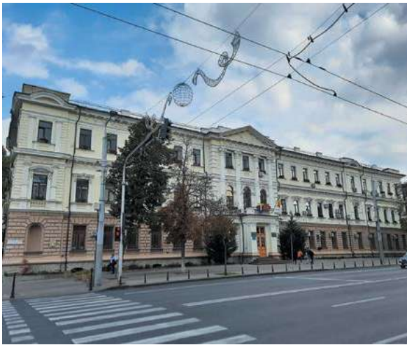
Fig. 9. The main building of the Technical University of Moldova, Chişinău (the author of reconstruction R. Spirer).