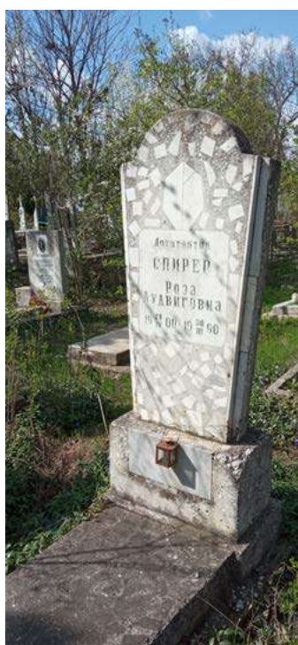
Fig. 11. The funerary monument of the Architect R. Spirer at the “St. Lazar” Cemetery, Chişinău.

Other achievements of the architect during the Soviet period are the reconstruction of the Boys' Gymnasium in the town of Bălţi (1941–1961); two variants of the reconstruction project of the Drama Theater in Tiraspol (they remained only on paper) (early 1950s, in collaboration); the dormitory for students of the Pedagogical Institute in Tiraspol (1953–1954); the Palace of Soviets in Cahul (1952–1954), later transformed into the “A.S. Makarenko” Pedagogical College, today the “B.P. Hasdeu” State University; the residential building with the pharmacy built on 25 Octombrie Street in