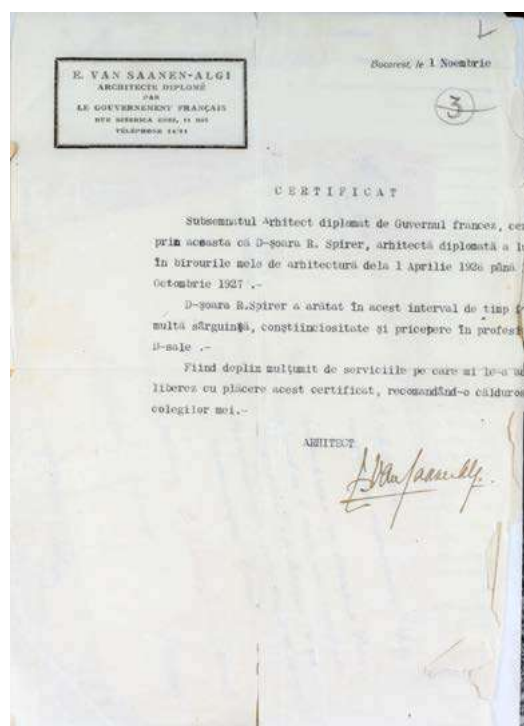
Fig. 3. Certificate, signed by the architect E. Van-Saagen Algi (NAA).

Etti-Roza Spirer put into practice the Romanian modernist style, creating valuable architectural works that still do honor to the town