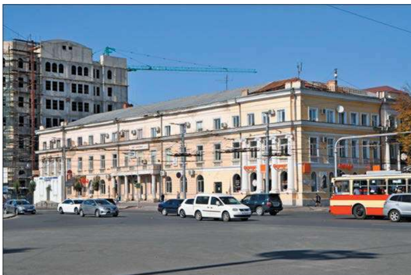
Fig. 6. The reconstructed building of the former “Suisse” hotel, Chișinău (the author of reconstruction R. Spirer, the consultant A.V. Shchusev) ( http://wikimapia.org/9478216/Librarie-Biblioteca-B-P-Hajdeu-Fostul-Hotel-Suisse-Chi%C5%9Fin%C4%83u#/photo/7634652 ).